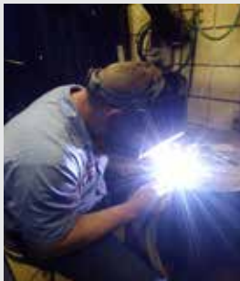
AWS Behind the Mask - APT was awarded 1st and 2nd in GTAW welding competition.