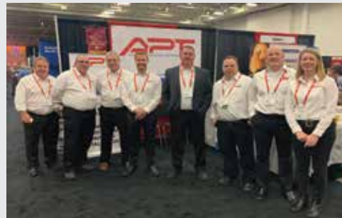
Cheese Industry Conference - Madison