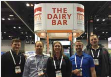
ProFood Tech - Chicago

As proud members of 11 Associations from coast to coast, APT attends valuable conferences and meetings from the International Production & Process Expo to the Northeast Dairy Convention, constantly keeping up to date on industry trends.